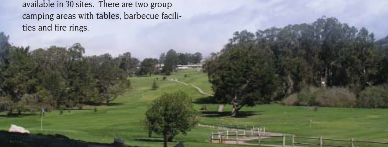
Morro Bay State Park Golf Course